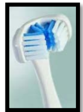
Barman's Superbrush www.sensationalkids.com