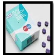
Tepe Plaque Search Tablets