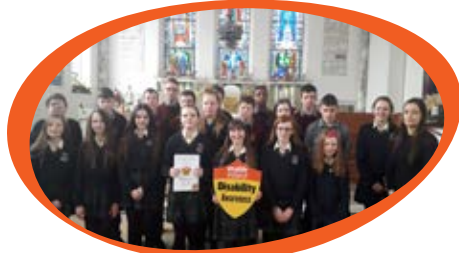
St. Louis Community School, Kiltimagh receive their Disability Awareness Shield

You can sign up today by emailing campaigns@enableireland.ie .