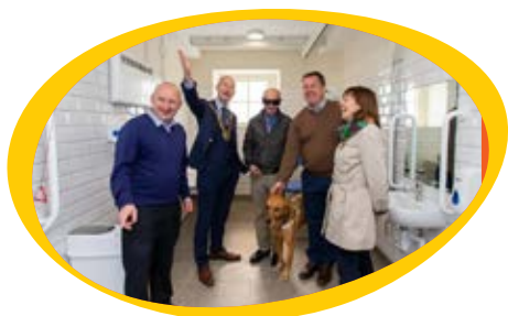
The new Changing Places facility in Marlay Park

‘Changing Places’ is a campaign to highlight the lack of appropriate changing facilities in Ireland, and to lobby for the provision of more fully accessible changing places in shopping centres, libraries and public spaces across the country. Additional features of Changing Places bathrooms include more room, a fully accessible toilet with height-adjustable, adult-sized changing benches, ceiling track hoist systems, showers and adequate space for a person with a disability and up to two assistants.