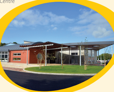
The Lavanagh Centre