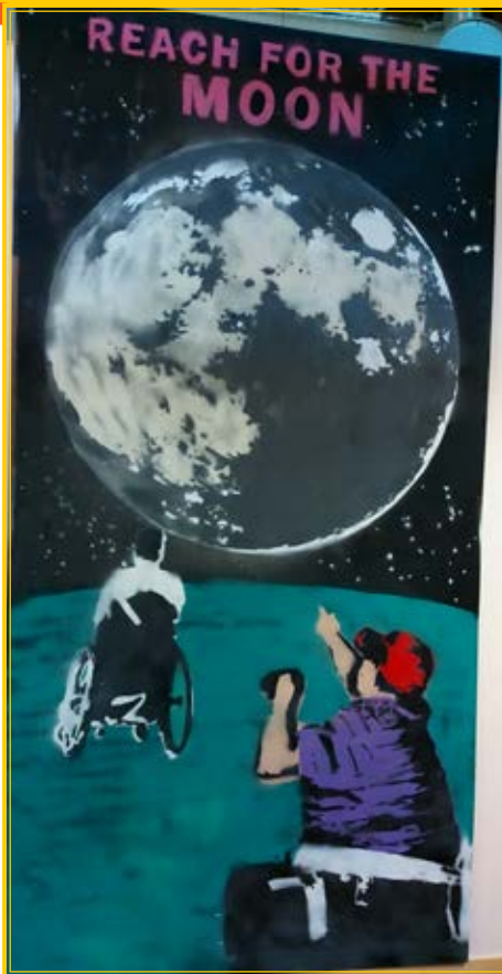
Reach for the Moon

Research shows us that participation in arts activities helps to maintain the health and quality of life of adults. Visual arts, including painting and graffiti, generate increases in self-esteem, psychological health, and social engagement.