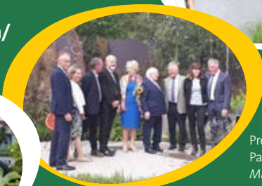
President of Ireland and Patron of Enable Ireland, Michael D. Higgins , in our Diversity Garden at Bloom 2019.